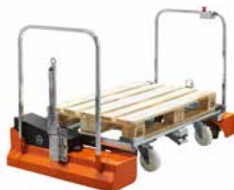
TAXI carrier Transporting subsidiary load offering train solutions for full-pallets and half-pallets

Typical load carriers that can operate with the BT Movit S-series include: