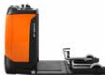
ORDER PICKING TSE100W