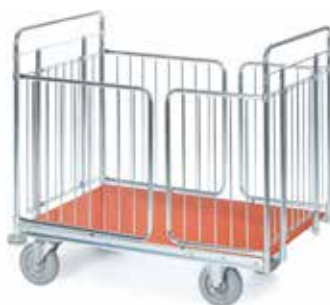
PARCEL carrier Designed for carriage of items of multiple sizes and shapes, with easy to open gates

Typical load carriers that can operate with the BT Movit N-series include: