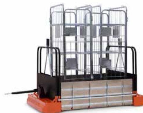
PLATFORM TAXI carrier Designed for easy and flexible transport of loads of different sizes like containers or roll cages