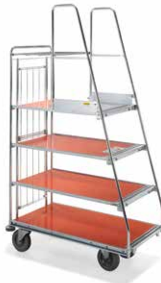
STEP carrier Step-up facility allowing order picking from higher levels