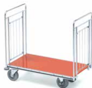
PLATFORM carrier Fast, easy and flexible transportation of stable goods