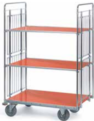
SHELF carrier Allowing sortation of items during the transportation process

The BT Movit N-series' battery can be changed in under a minute thanks to the convenient battery drawer.