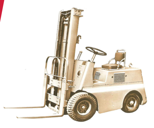
The first Toyota counterbalance truck was produced in 1956.

Our approach is to provide you with services and solutions that help you to get the most out of your equipment, while allowing you to get on with what you do best – running your business.